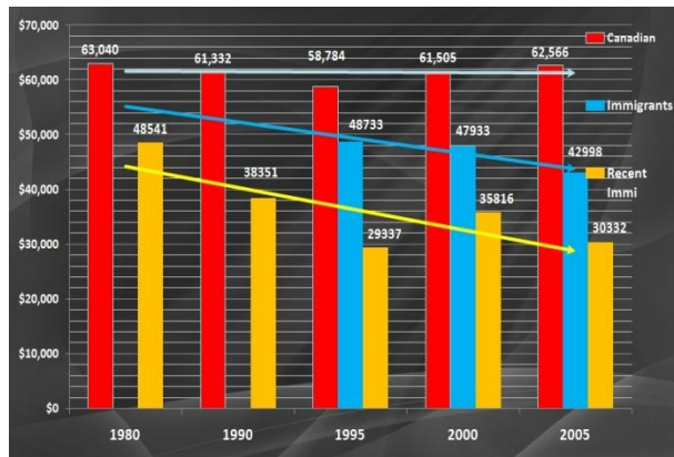
Figure 1 : Earnings of immigrant men with university degree, data sources Statscan, figure by Human Endeavour

It is a well-established fact now that immigrants landing in Canada during the early 1990s faced more